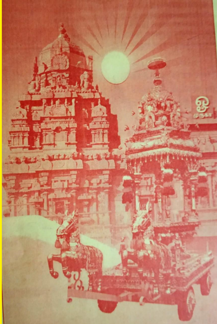
THANGA RATHAM GOLDEN CHARIOT